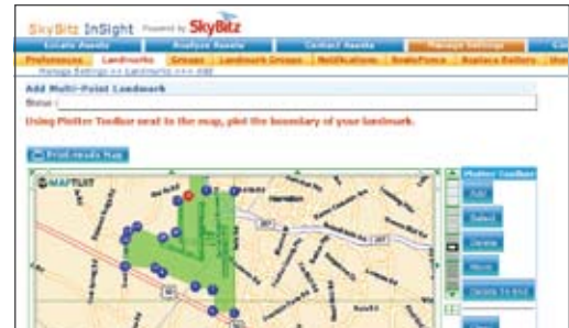
Custom Polygonal Landmarks