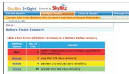
Battery Status Report

ELM Technologies Ltd. (905) 826-1545 www.elmtechnologies.com